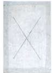
ZINCALUME® steel (240 hours)